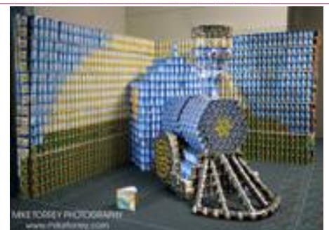
"I CAN" by Childs Mascari Warner

We are looking for a host site. If your site can accommodate 10-15 structures, please contact us. Ideal locations would be the convention center, a gymnasium, a shopping center, or a museum. The space needs to be inside a covered area and able to handle a fair amount of foot traffic. If you can help with space, please contact Julie King at: jking@canstructionsd.org