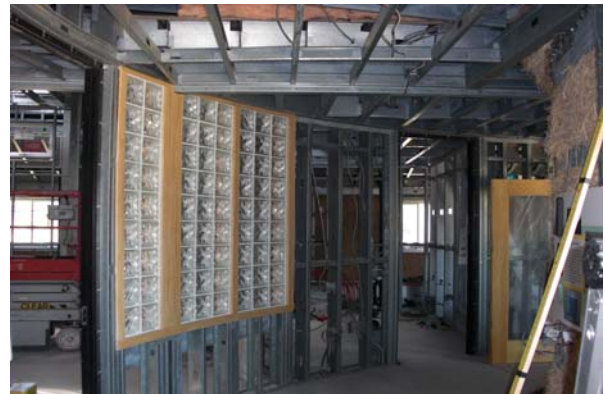
Interior view - all steel was processed in a "green" facility and donated for the project