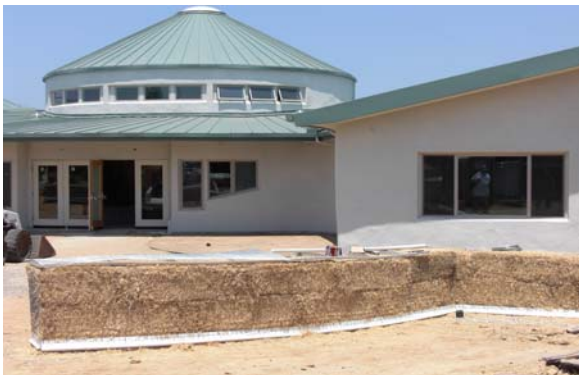
Exterior view showing exposed straw bale walls under construction

The Friends Center will be an energy-efficient straw bale building--the first in central city San Diego--featuring innovative, durable and proven straw bale construction, as well as solar power, passive solar design, water recycling and other energy-efficient components. As an environmentally-sound "green" building, the Friends Center will demonstrate the groups' shared values and be a witness to their commitment to wise stewardship of the earth's resources.